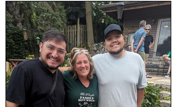
The photographers spent much of the day with us and took the portraits and many of the candid pictures in our calendar.