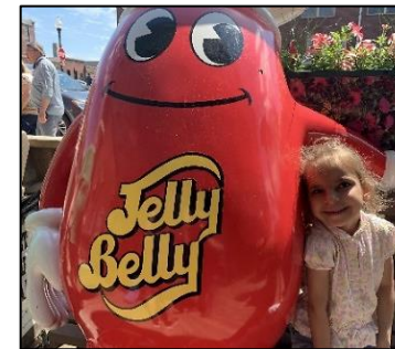
Jelly Belly made a Friend