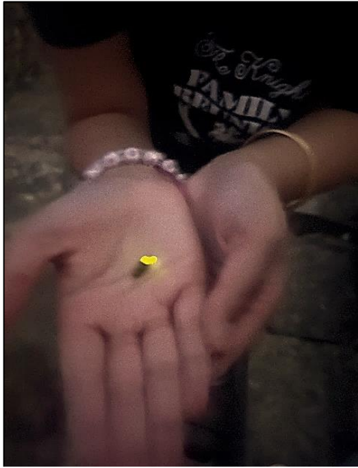
Janvi admires her first firefly.

There was no shortage of food or dessert